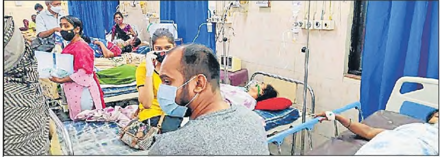
महाराष्ट्र में नागपुर के जीएमसी कोविड अस्पताल में बिस्तरों की कमी के कारण एक बेड पर दो मरीजों को रखना पड़ रहा।

प्रधानमंत्री मोदी ने हालात का जायजा लिया : इससे पहले प्रधानमंत्री नरेंद्र मोदी ने आला अफसरों के साथ बैठक की और संक्रमण थामने को पांच सूत्रीय रणनीति पर जोर दिया। इनमें ज्यादा से ज्यादा लोगों की जांच, संक्रमितों के संपर्क में आए लोगों की तलाश, सही उपचार, कोरोना अनुकूल व्यवहार व टीकाकरण शामिल है।