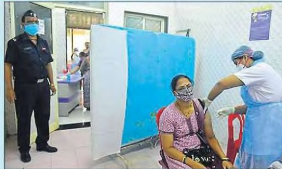
Vaccination in progress at a Worli hospital.